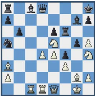
Position after 24.gxh5