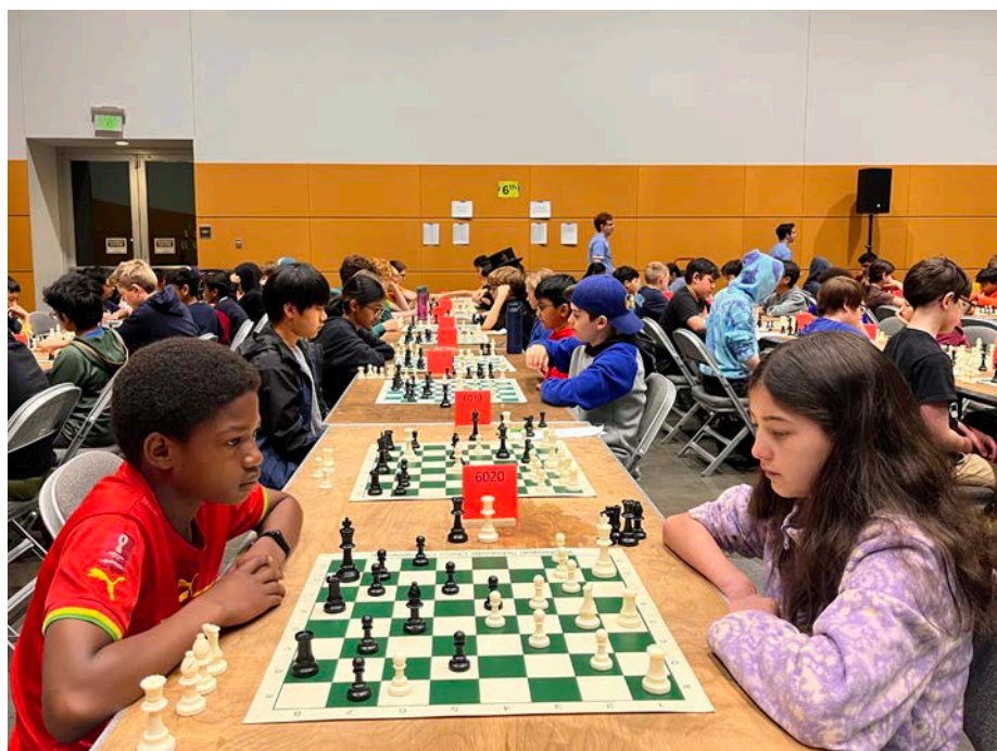
Two players engage in an imbalanced middlegame position in the 6th grade section of the 2025 WSECC.