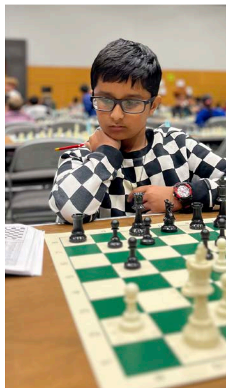
A young participant sports his chess-themed attire that would be equally appropriate for a Nascar race.

Sixth—Forest View Elementary (16.0, Everett)