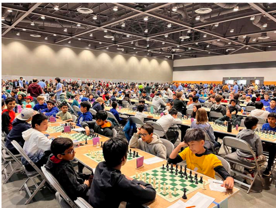
The top boards of the 5th grade section amidst the sea of chess players at the record-setting 2025 Washington State Elementary Chess Championships.