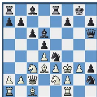
Position after 19...Nh2#