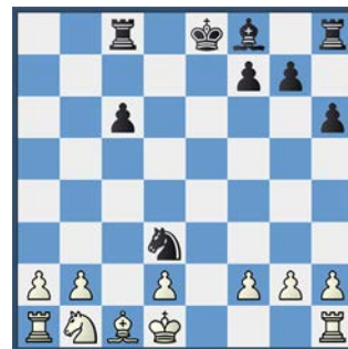
Position after 19...Nxd3

14.Qd4 Qe6+ 15.Qe5 Qxe5+ 16.Nxe5 Bf5 17.Nd3 Bxd3 18.cxd3 Nb4 19.Kd1 Nxd3