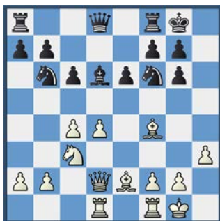
Position after 14...Bd6

A crucial tactical error. 14...Bb4 or 14...Re8 would have been fine.