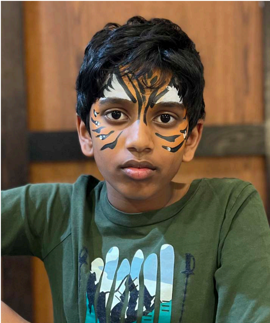
A competitor sports his tiger face paint at the 2024 SPFNO.