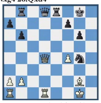
Position after 26.Qxd4