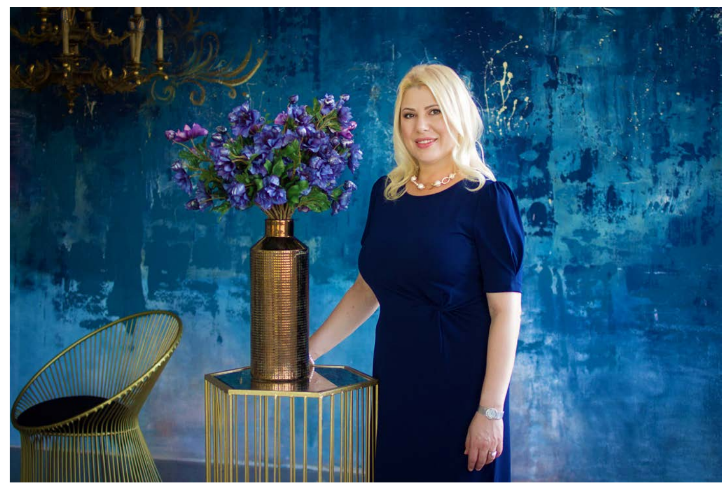
Susan Polgar.

I like to say the only constant in life is change. Every single move on the chess board can change the dynamic of the game. You need to realize how those changes affect the overall picture on the board and constantly adjust to those changes. Chess trains young people to