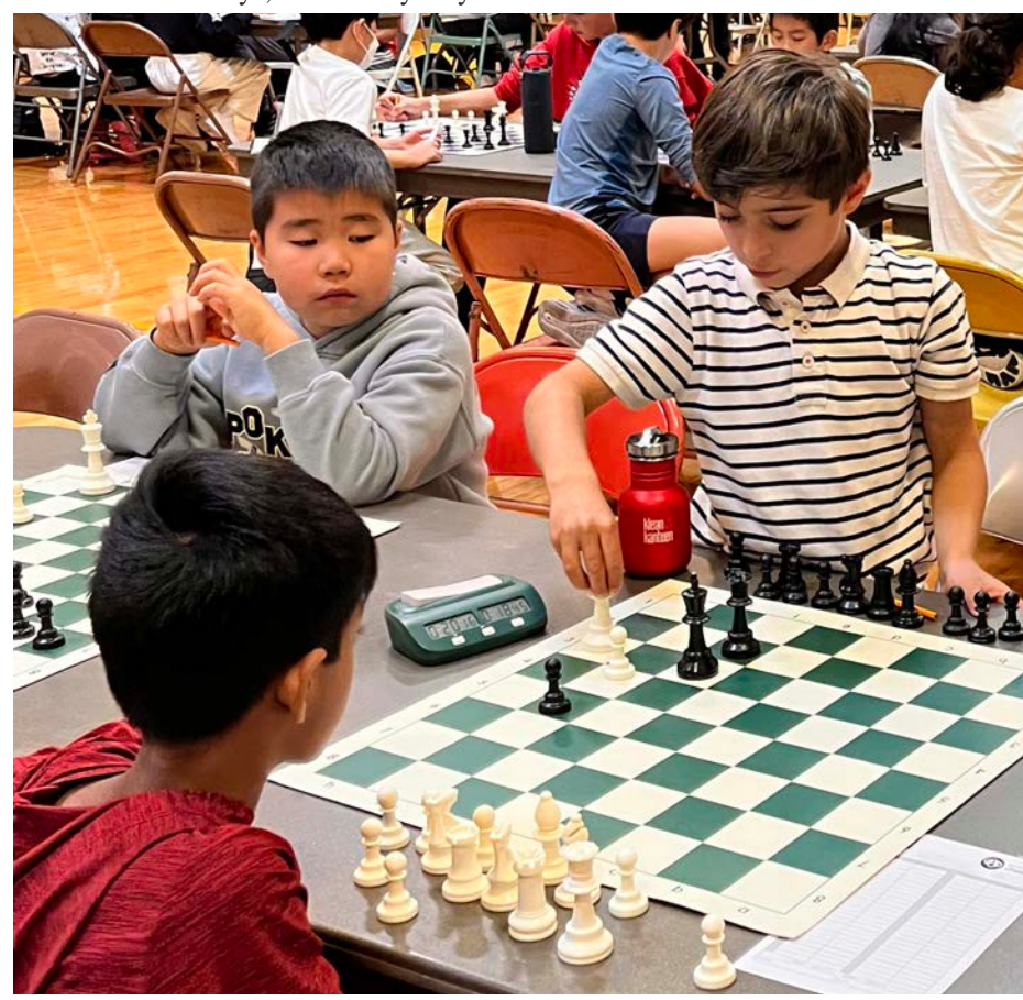
White is in Stalemate!

Many thanks to the adventurous chess explorers who participated, twelve of whom were unrated and playing in their first ever chess tournament! Our vibrant chess community continues to thrive as we all begin new adventures and kick off a new scholastic chess season. Special congratulations to our Amazon gift card and chess medal winners: