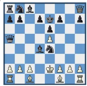
Position after 10...Ke7