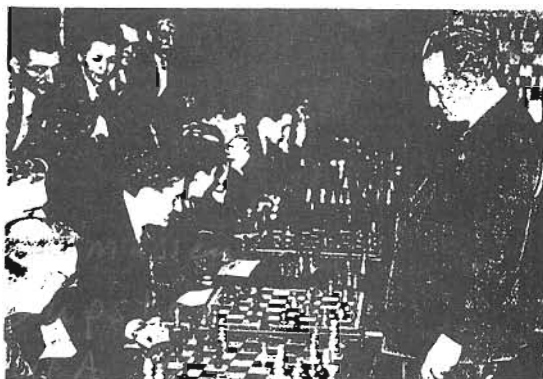
Frank J. Marshall group exhibition at the Marshall Chess Club, 1943

*Although U.S. Champion from 1909 to 1936, Frank Marshall did not put his title at risk after 1923