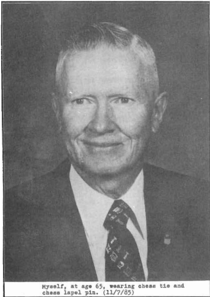
Myself, at age 65, wearing chess tie and chess lapel pin. (11/7/85)