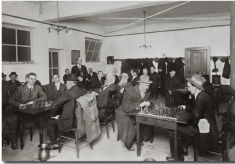
Portland Chess and Checker Club 1914 – Circle Theater